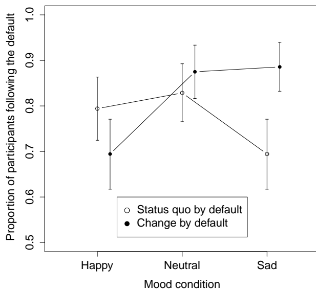
Figure 3: Proportion of participants following the default by type of default and mood condition. Error bars represent standard errors of the mean.

Participants in the happy condition were more excited than participants in the neutral condition ( p = .004 ), but did not differ from them in their ratings of anger and curiosity. There were no differences in how jittery participants felt. Mean and standard deviations of all affect measures can be found in the Appendix.